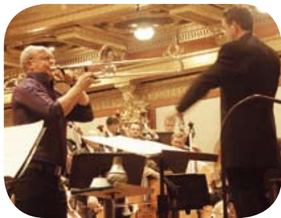
FAIRLIGHT MUSIKVEREIN LINDBERG DE BILLY